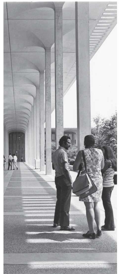
Archival photograph, uptown campus