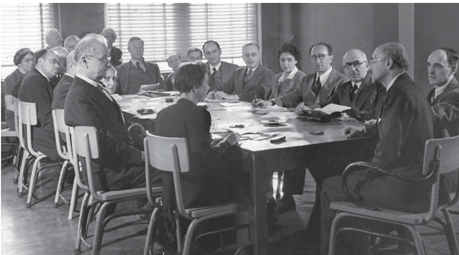
University in Exile, New York City, ca. 1934.

On Thursday, October 12, the University Libraries will present "University in Exile, 1933-1953: Refugee Scholars in New York, the New School for Social Research, and the German and Jewish Intellectual Émigré Collection." Led by a panel of distinguished scholars, the program will feature an overview of the widespread exile and escape of