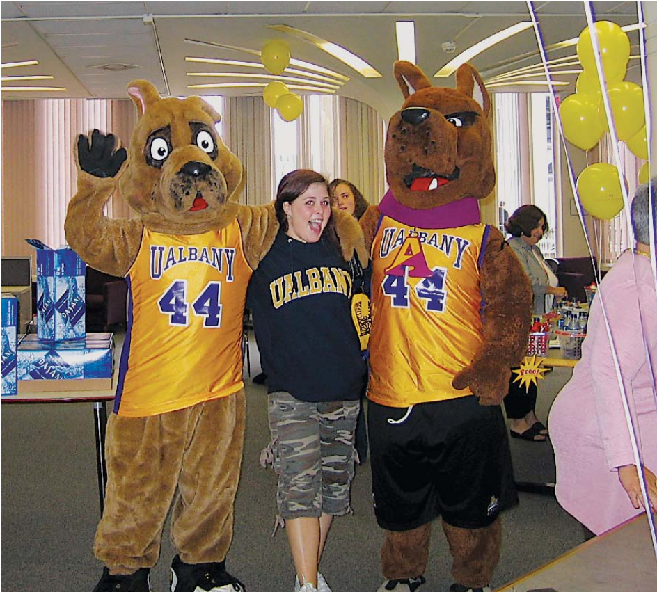
Library Palooza attracted more than 600 students on September 4, 2006.