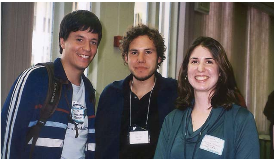
International Students event on August 30th.